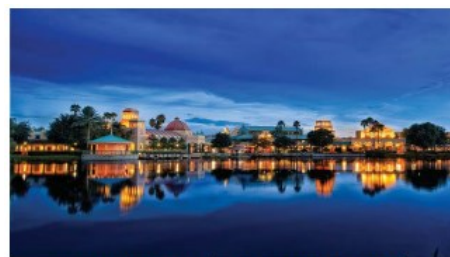
Coronado Springs Lake

FTYCMA attendees in San Diego will be wearing t-shirts and giving away incentives and reminders at this year's conference. T-shirts will also be provided for those who are helping at the Orlando venue.